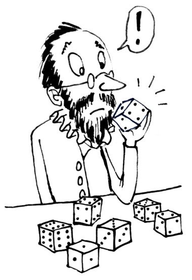
THE INVENTION OF CHANCE

It needs to be mentioned that the use of material lacks variation. Most of the pieces are printed on glossy paper, the chosen sizes are very similar. Still 'Poster Sessions 2' is inventive and entertaining, tender yet brutal. A must-see for all those who want to know what the buzz is all about!